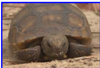
gopher tortoise ( Gopherus polyphemus )

Nature Wise, Inc. has recently begun production on the 30-minute documentary, Save Space for the Gopher Tortoise . Through this program, Nature Wise, Inc.