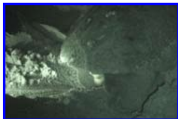
loggerhead sea turtle depositing eggs in nest

In June, Nature Wise, Inc. was given the opportunity to participate in a “Turtle Watch” on Canaveral National Seashore and to film sea turtles nesting on the beach for the upcoming program, Florida’s Coastal Treasures .