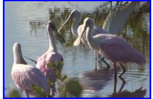
Roseate Spoonbills, winter visitors to the Merritt Island National Wildlife Refuge

National Seashore and Merritt Island National Wildlife Refuge are important sources of local tourism revenue. As the NASA Space Shuttle program comes to an end, these natural areas are even more important to the local economy.