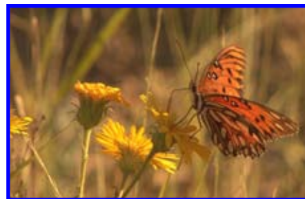
Gulf Fritillary on golden aster

Gardening for Native Pollinators has obtained two thirds of the funding necessary for production. If you would like to donate to this or any other Nature Wise, Inc. program, please see the "Make a Donation" section in this newsletter or visit www.naturewisetv.org .