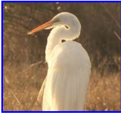
Merritt Island National Wildlife Refuge year-round resident, the Great Egret

Number nine in the Wildlife Matters series, Florida's Coastal Treasures: Canaveral National Seashore and Merritt Island National Wildlife Refuge is a 30-minute television documentary focusing on the natural significance of two important wildlife habitats and eco-tourism destinations. The program will highlight the unique natural features as well as the conservation efforts of each park.