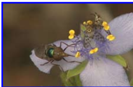
Pollinators on scrub dayflower

Coming soon from NatureWise, Inc. is Gardening for Native Pollinators , a 30-minute television documentary that aims to educate viewers on the importance of Florida's native