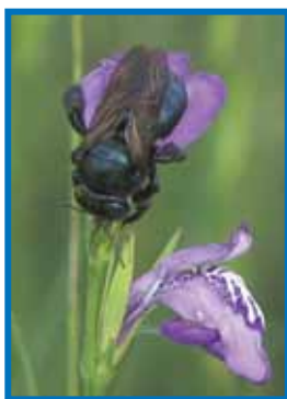
carpenter bee on waterwillow

If you've seen one bee you've seen them all, right? Not true. Nearly 20,000 species of native bees fill the world and vary according to their markings, behavior, social traits and nesting places. Scientists believe at least 5,000 distinct species of native bees exist in the United States alone; at least 200 native species occupy Florida. See if you recognize any of the following local native pollinator bees.